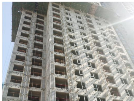
Construction project in Taiyuan County, Shanxi province