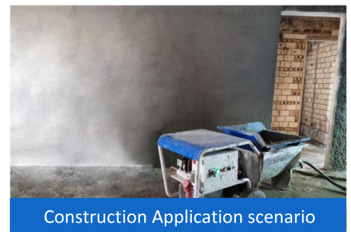
Construction Application scenario

Supporting spraying cement mortar,gypsum,concrete and other building materials.It has been applied in many construction such as Hubei,Longnan in Gansu province,Zunyi in Guizhou.Greatly simplifies the work process,improve work efficiency,suitable for interior or exterior and self-flow equality projects.Related construction quality has been highly recognized by the project department and the construction team.