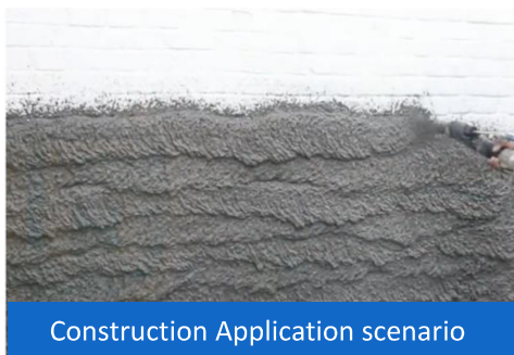
Construction Application scenario