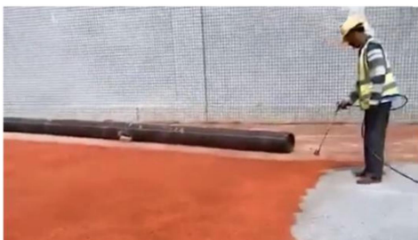
Highway Construction Scene